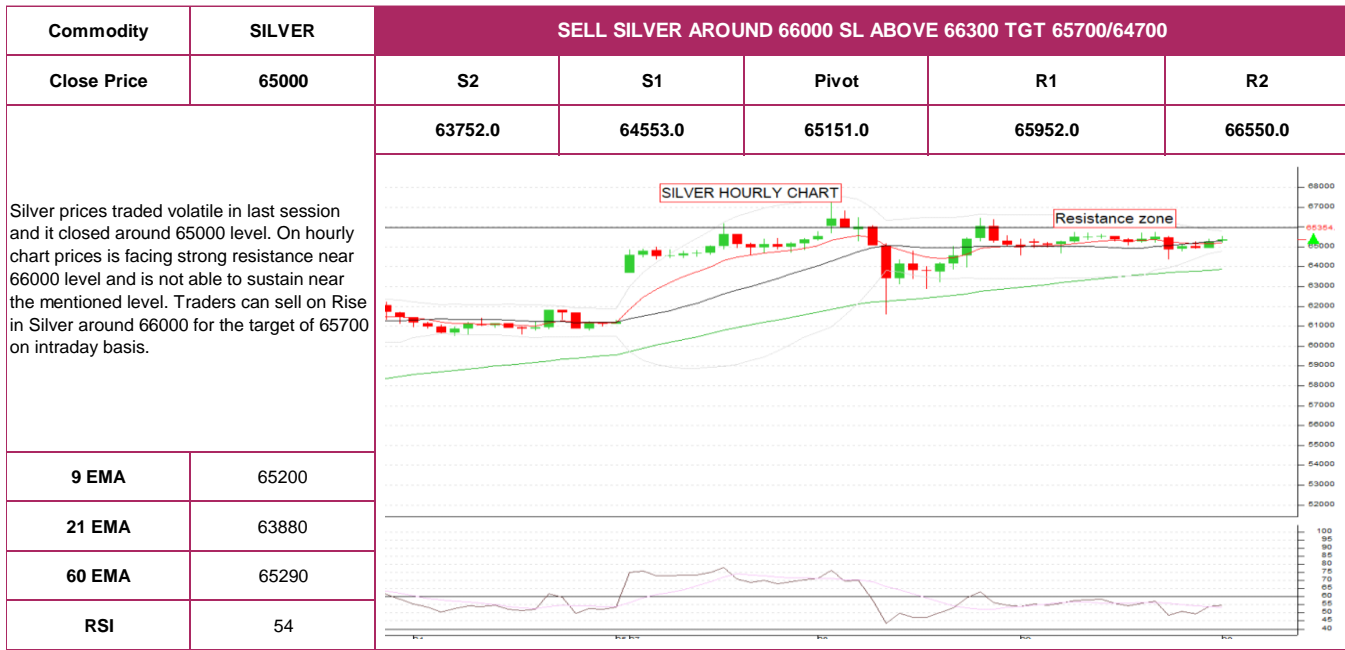
Chart of the day