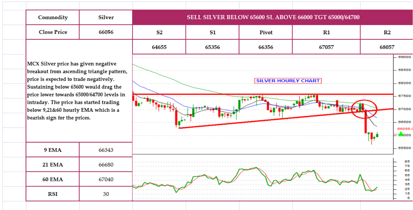
Chart of the day