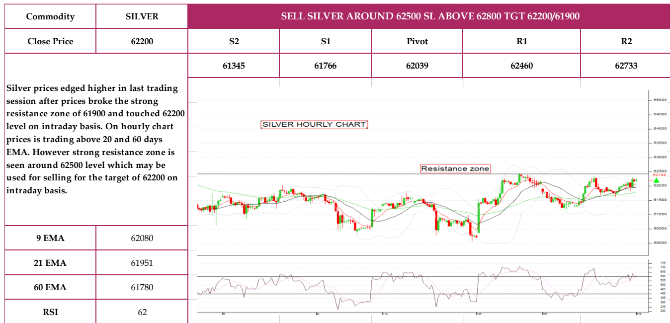
Chart of the day