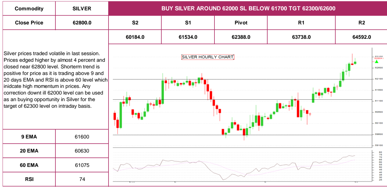
Chart of the day