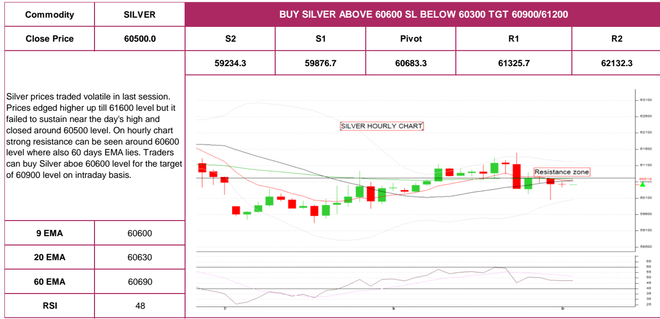
Chart of the day