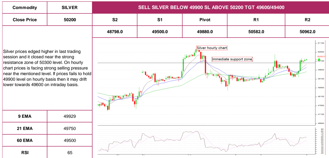
Chart of the day