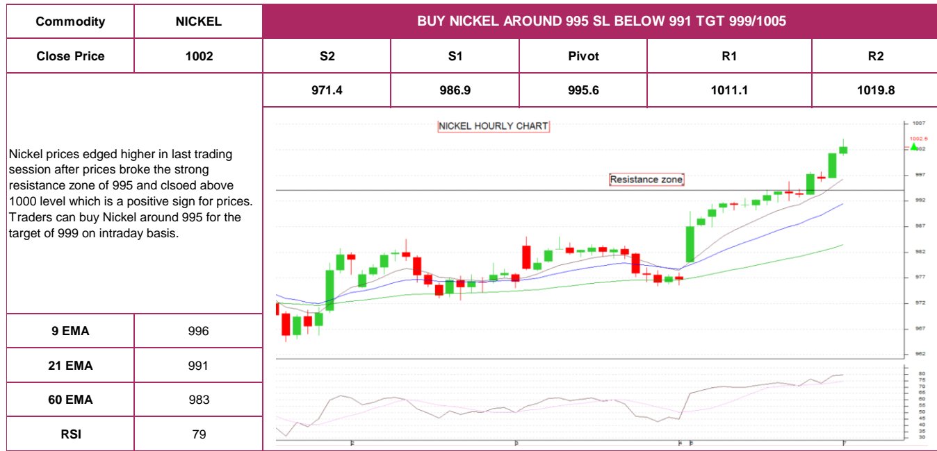
Chart of the day