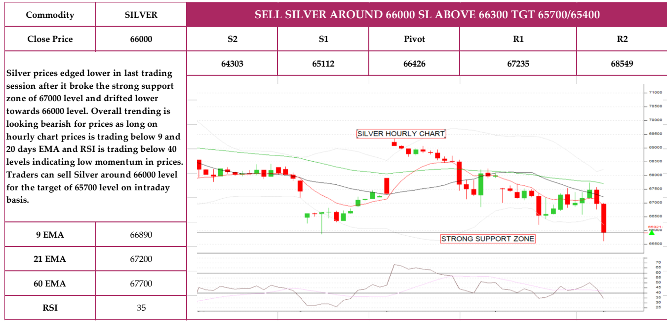
Chart of the day