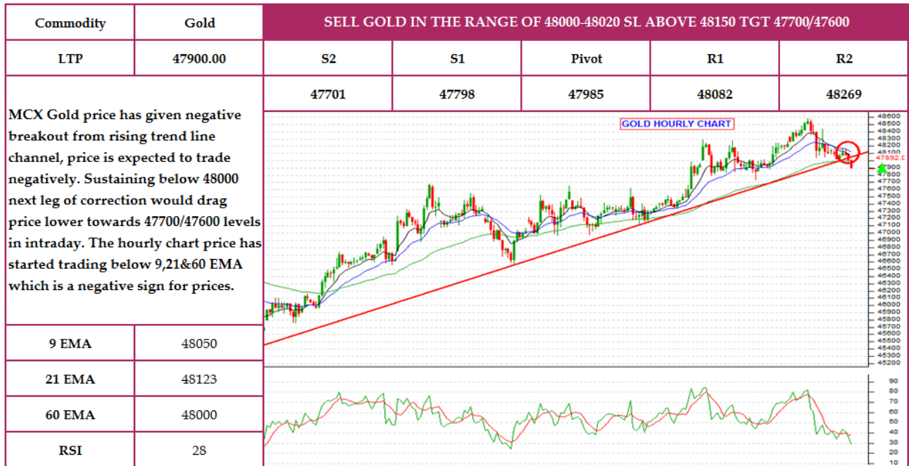
Chart of the days