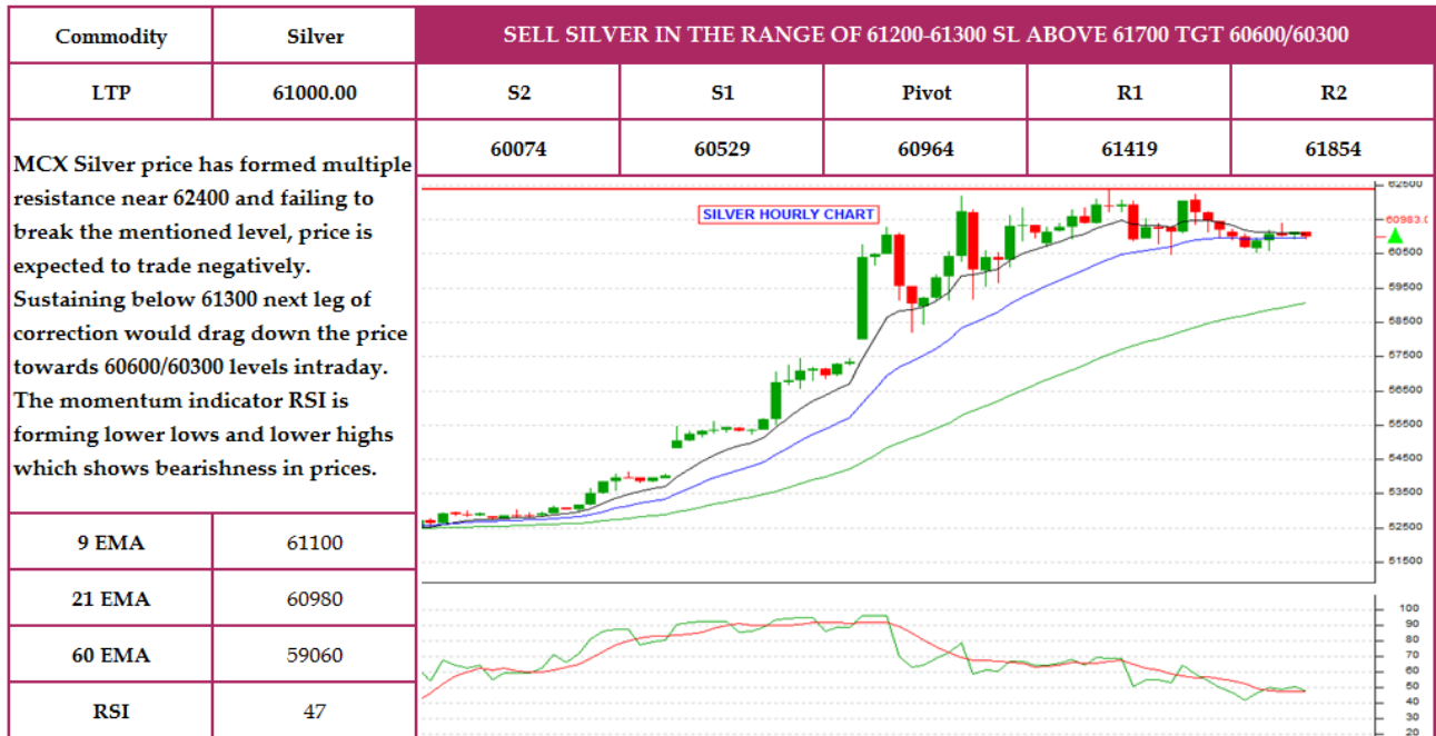
Chart of the days