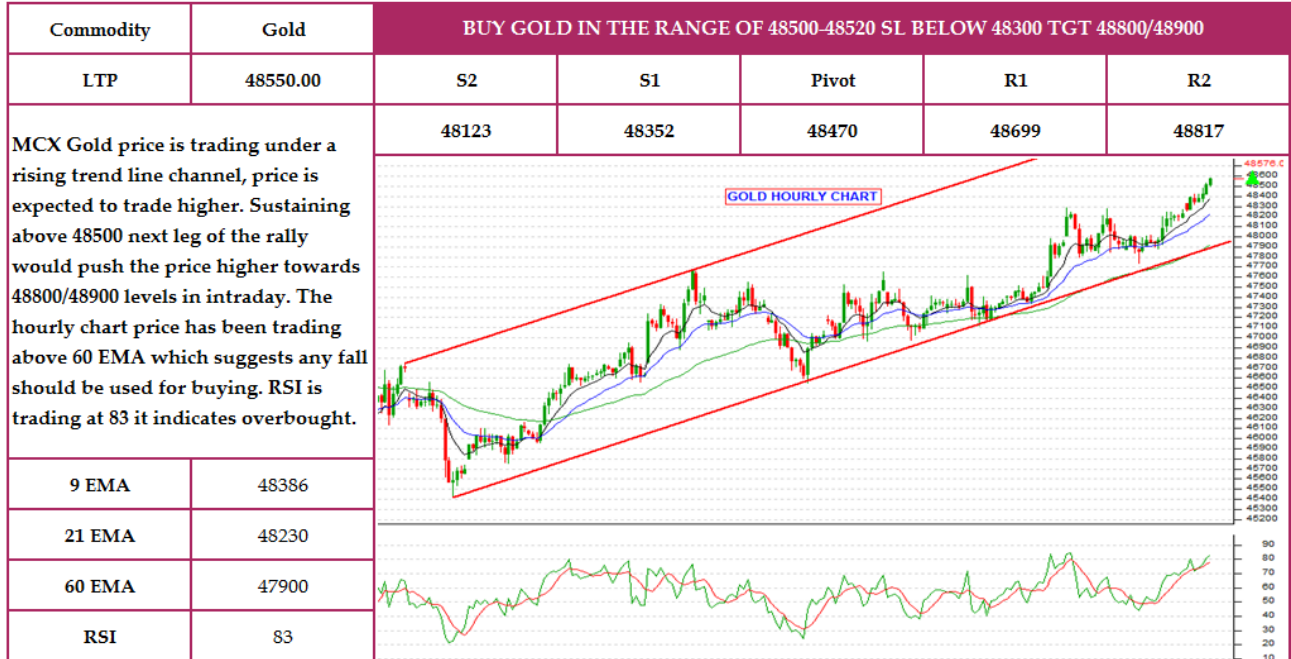
Chart of the days