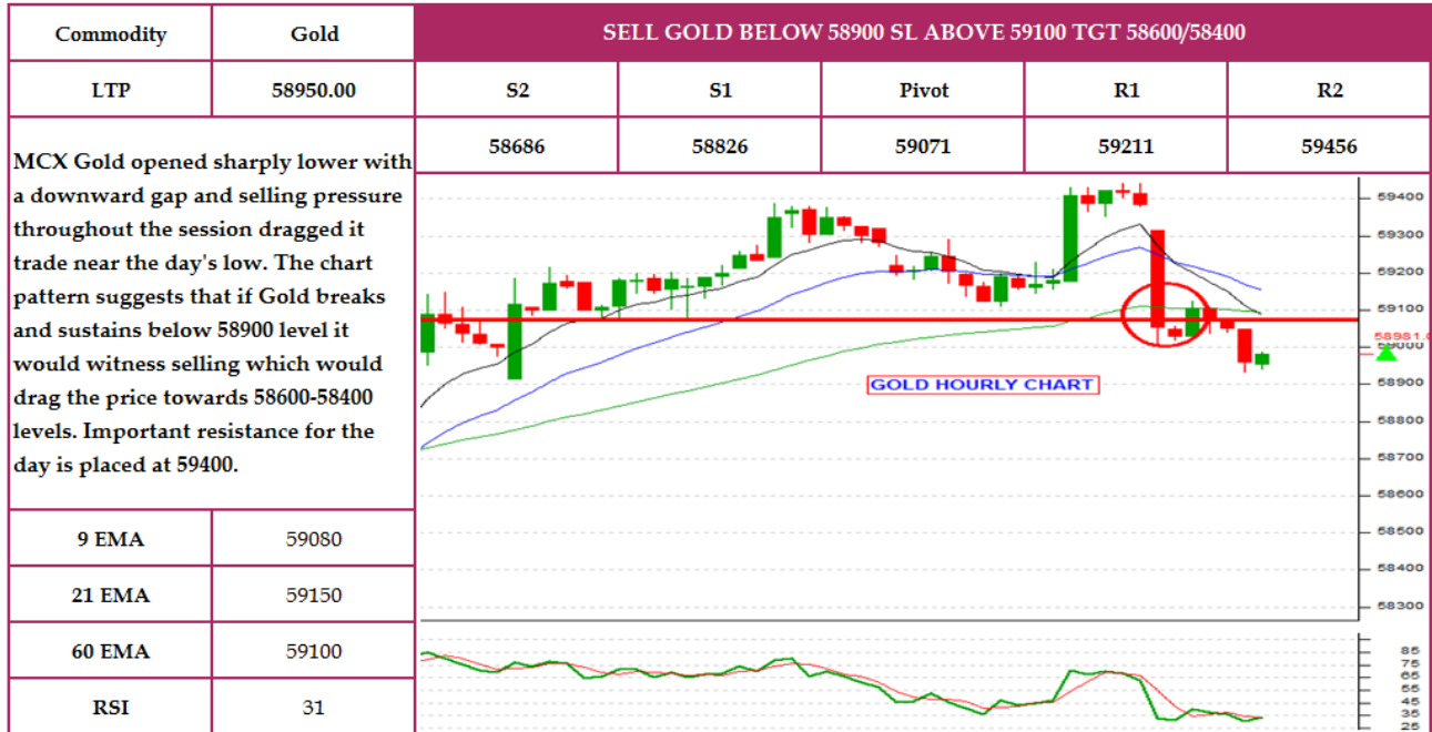
Chart for the day