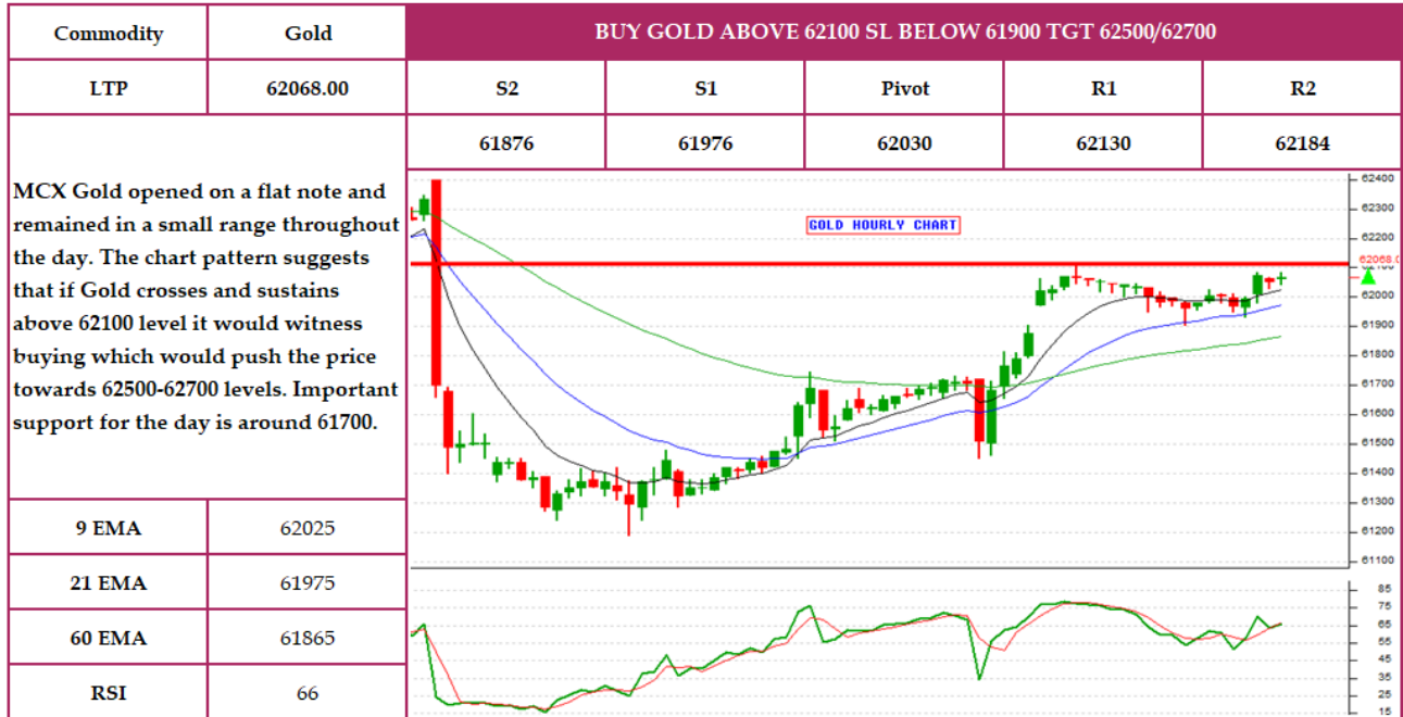
Chart for the day