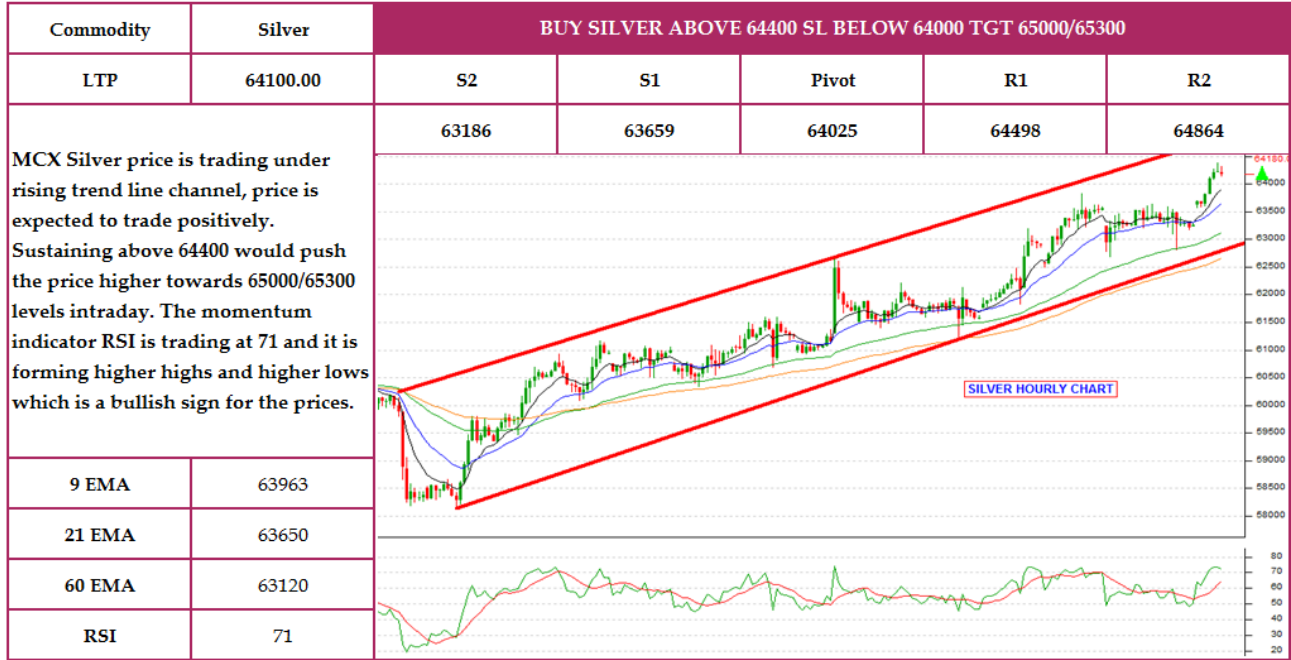
Chart of the days