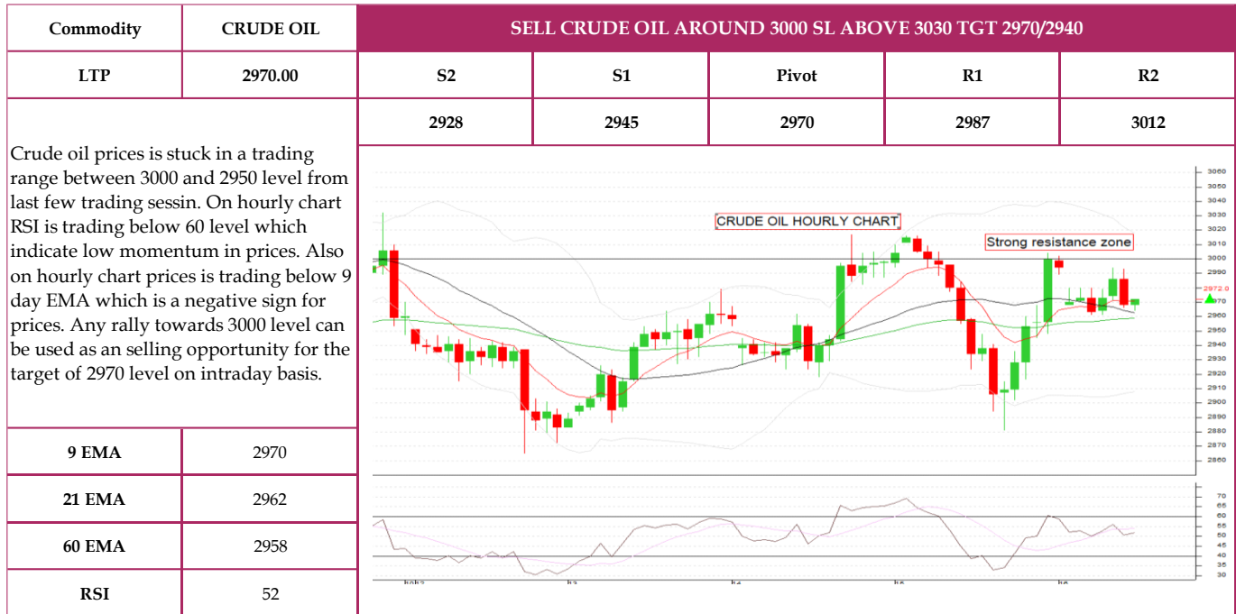
Chart of the days