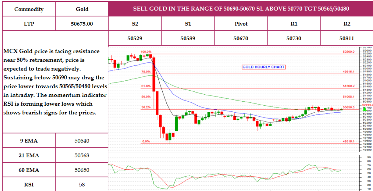
Chart of the days