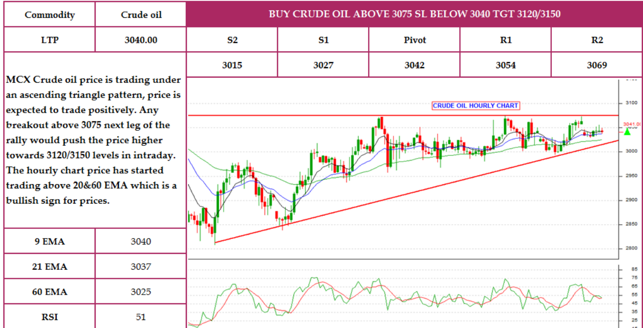
Chart of the days