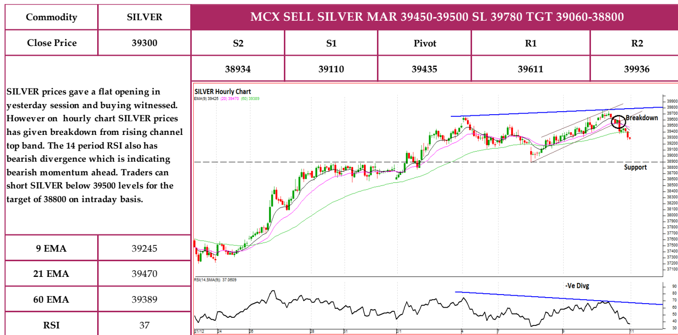
Chart of the day