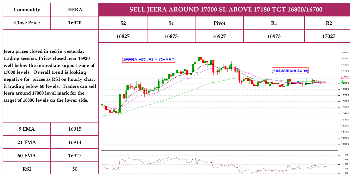
Chart of the day