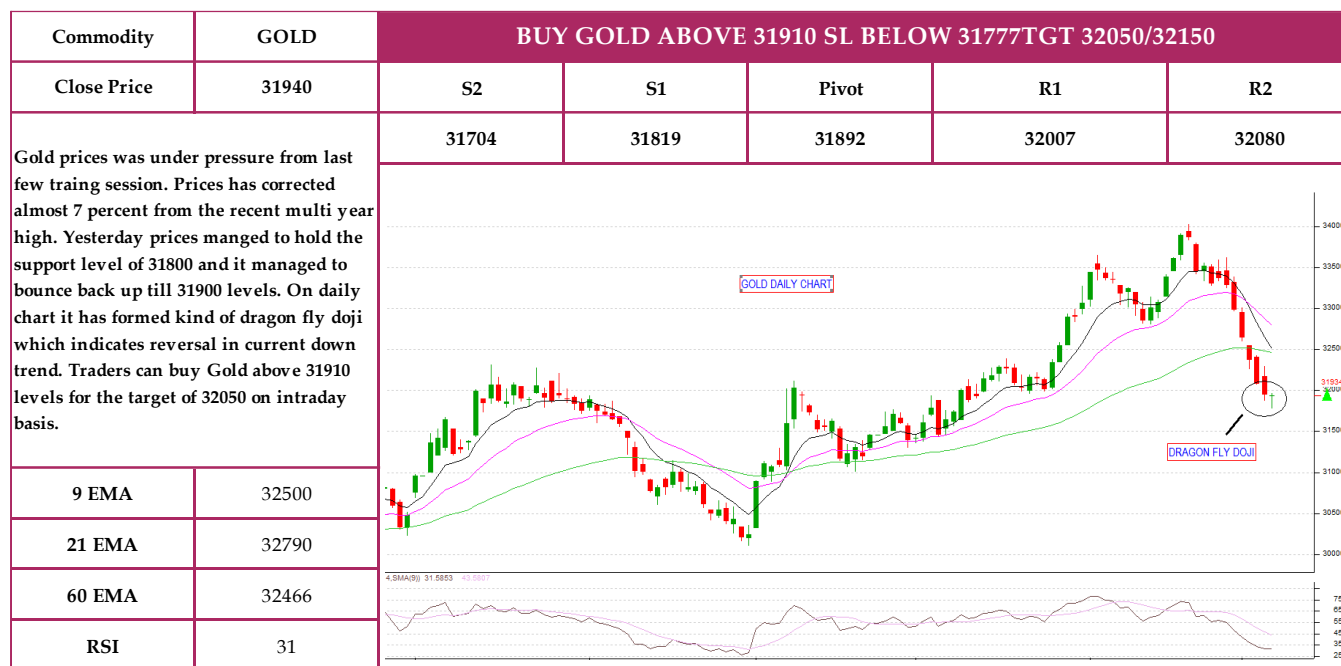
Chart of the day