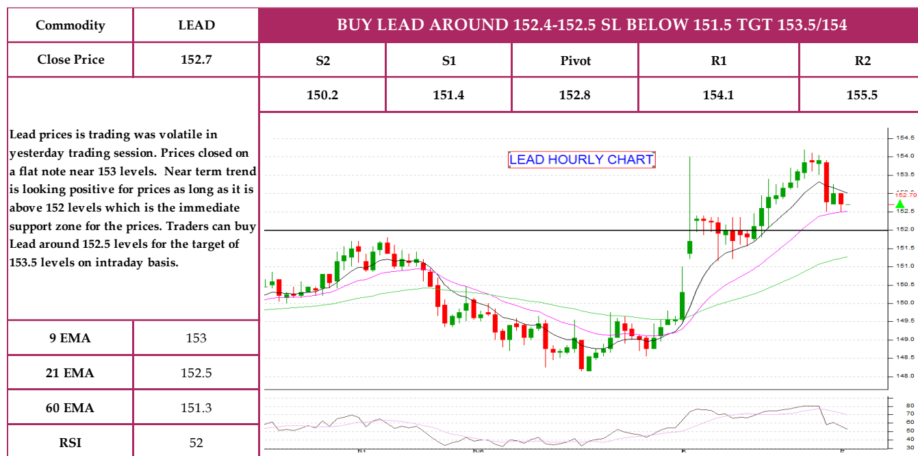
Chart of the day