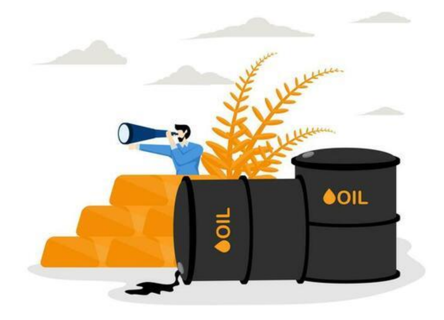
Commodities Evening Wrap