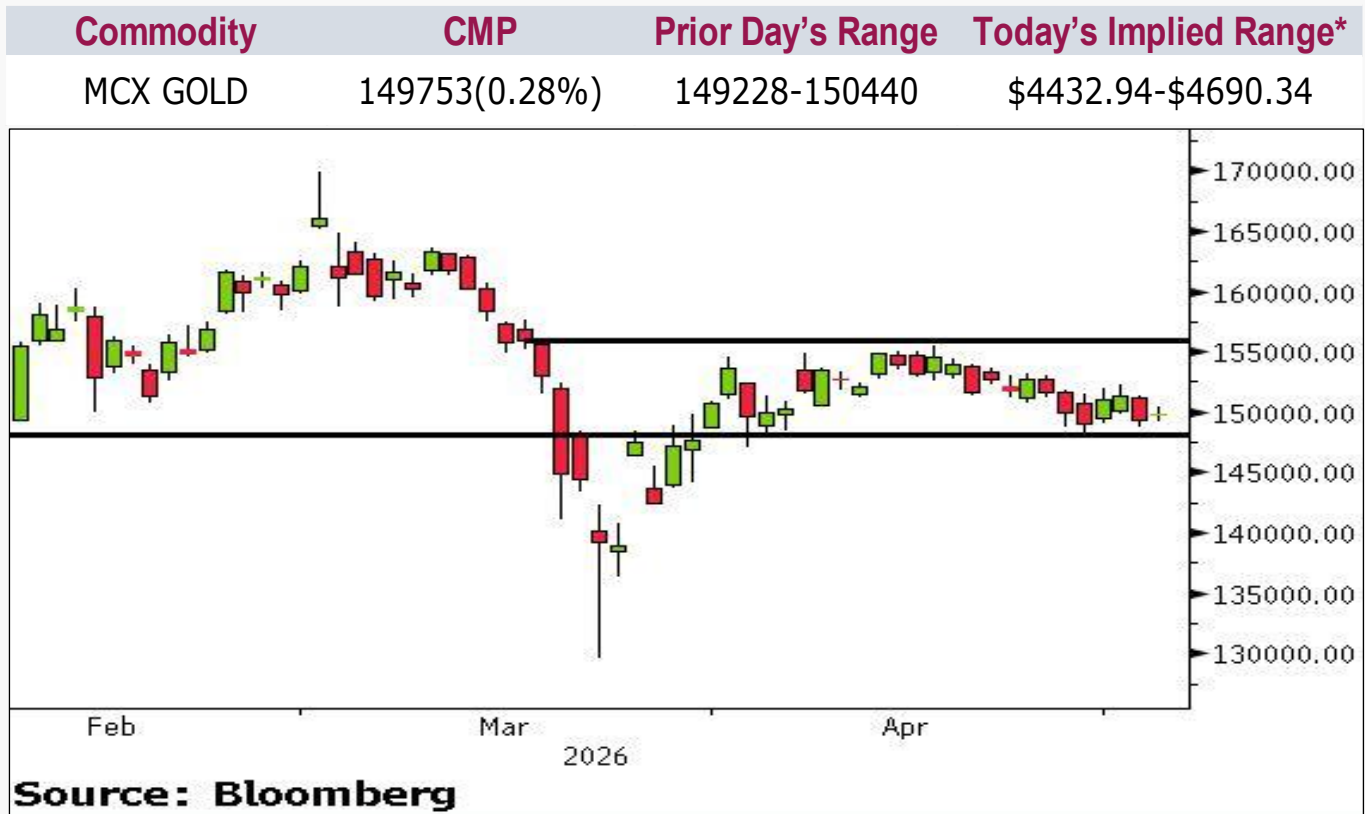
The implied range is for the Comex front-month futures